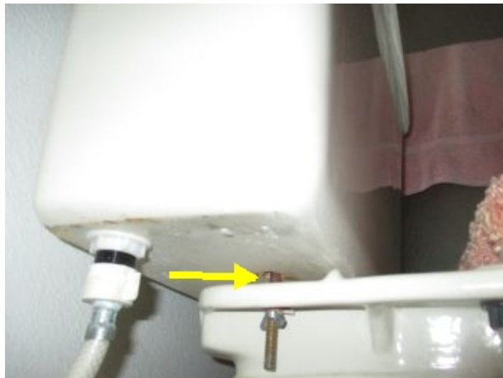
Toilet leaked between tank and toilet. This is likely due to a deteriorated gasket ring between the toilet and tank.