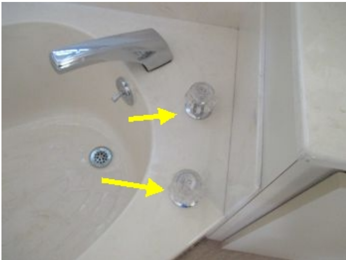
Tub faucet did not operate properly. Water is turned off at shutoffs located in the vanity access panel.