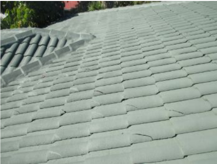
Many cracked and broken tiles on the roof. Recommend evaluation by a licensed roofing contractor.