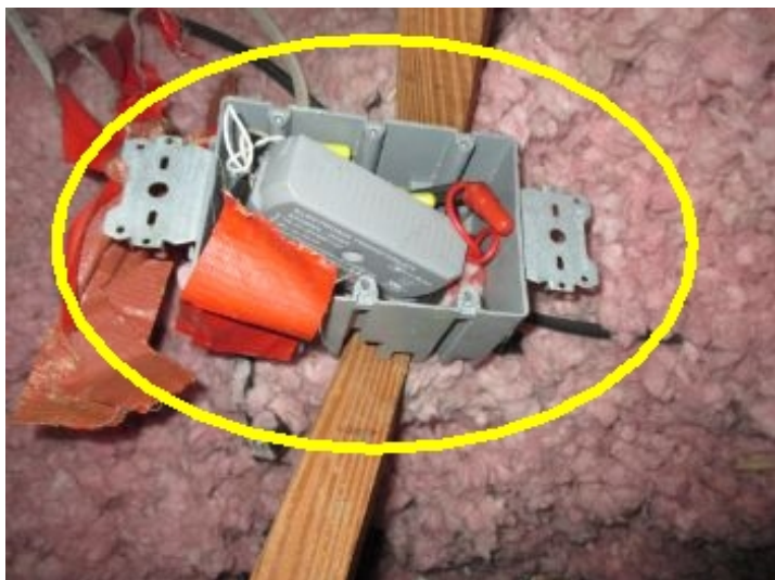
Low voltage transformer for kitchen under cabinet lights located in attic. It should be covered / secured.