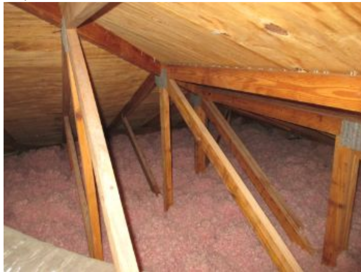
General overall condition appear satisfactory at the time of inspection.