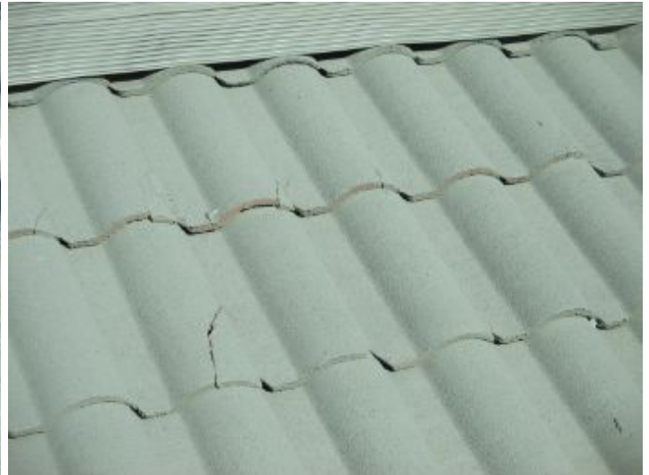
Many cracked and broken tiles on the roof. Recommend evaluation by a licensed roofing contractor.