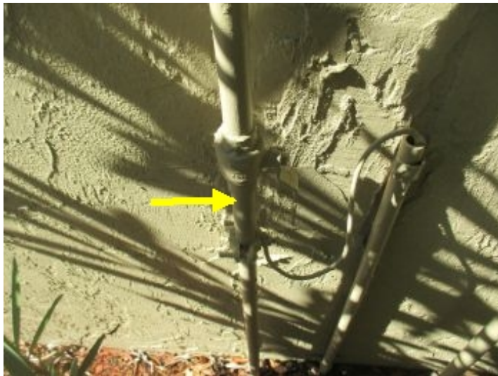
Main water shut off located on the right side of the home.