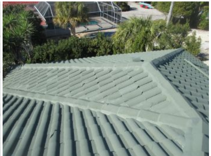
Many cracked and broken tiles on the roof. Recommend evaluation by a licensed roofing contractor.