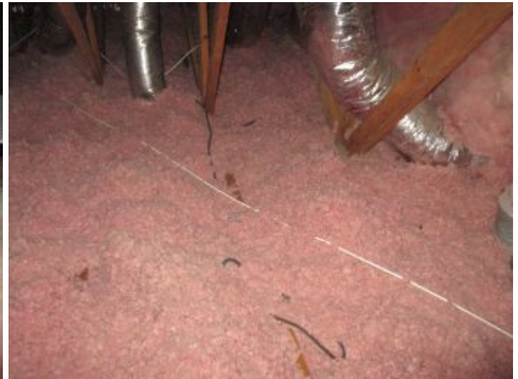
General overall condition appear satisfactory at the time of inspection.