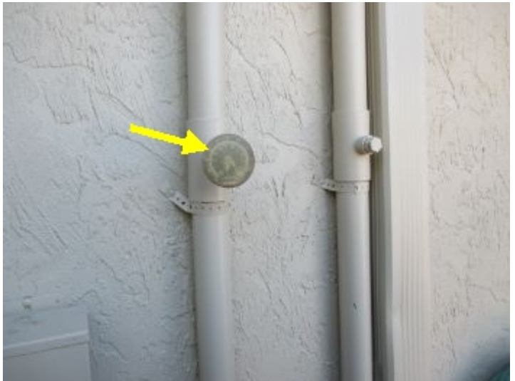
Filter pressure gauge did not appear to operate.