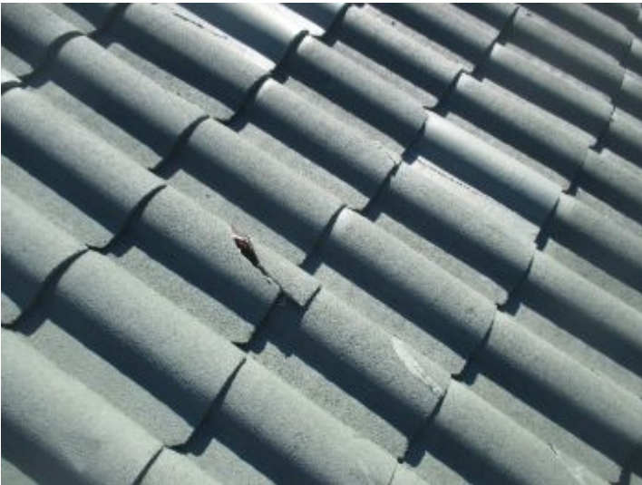
Many cracked and broken tiles on the roof. Recommend evaluation by a licensed roofing contractor.