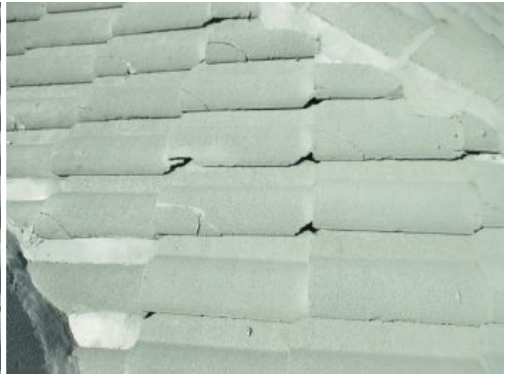
Many cracked and broken tiles on the roof. Recommend evaluation by a licensed roofing contractor.