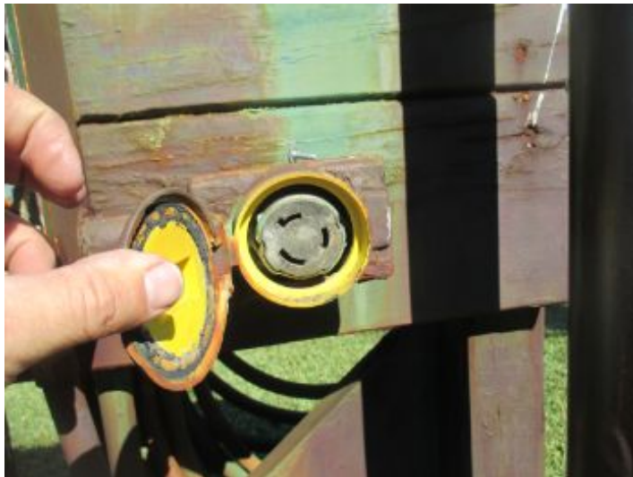
220 VAC receptacle adjacent to sub panel not connected in panel.