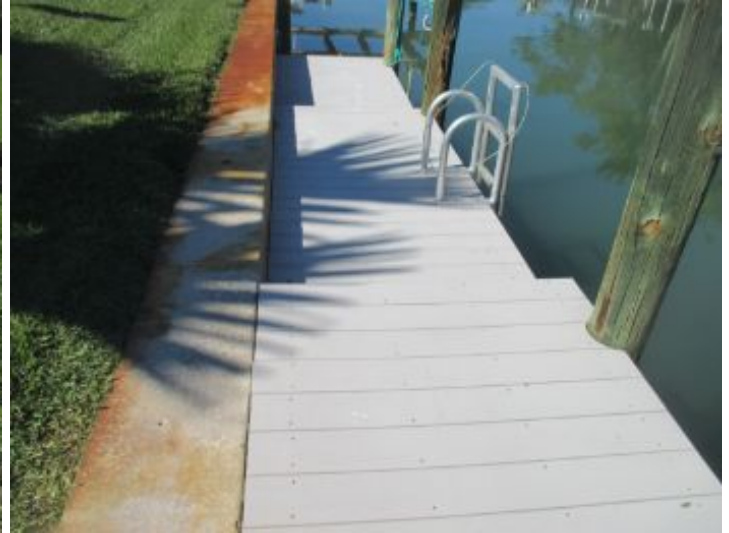
Appears in satisfactory and functional condition with normal wear for its age.