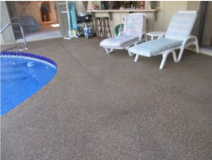
General overall condition appear satisfactory at the time of inspection.