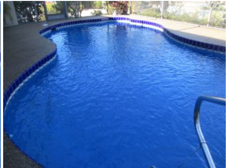
Cosmetic pool finish appeared to be in good condition.