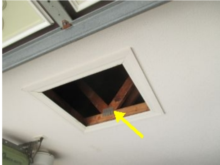
Scuttle cover in garage was missing.