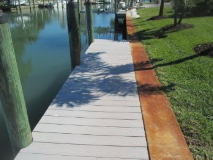
Appears in satisfactory and functional condition with normal wear for its age.