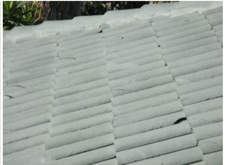
Many cracked and broken tiles on the roof. Recommend evaluation by a licensed roofing contractor.