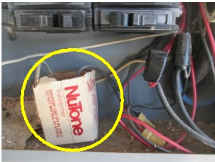
Door bell transformer located in the main electric panel, recommend relocating.