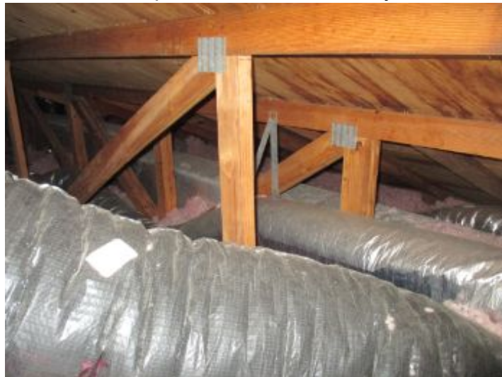
Visible areas appeared functional and in satisfactory condition at the time of inspection.