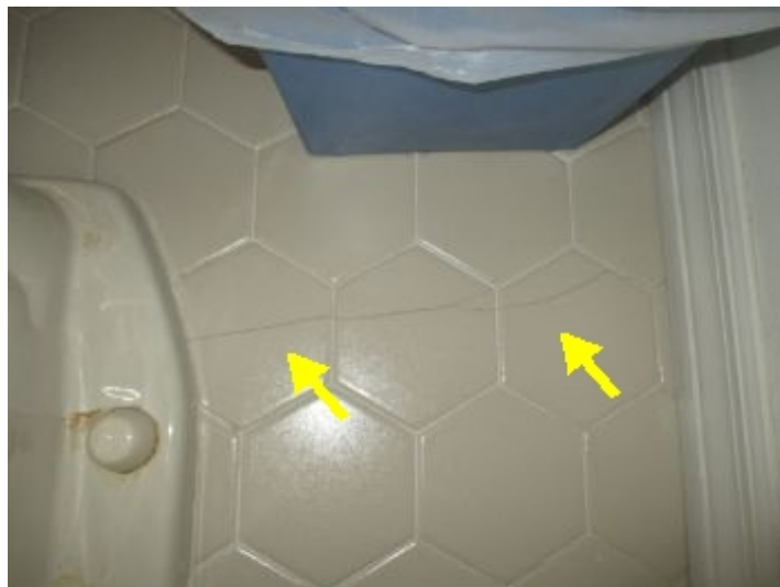
Cracked / damaged tile(s)