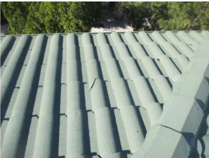
Many cracked and broken tiles on the roof. Recommend evaluation by a licensed roofing contractor.