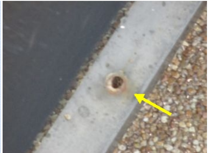
Fasteners of the screen frame to the concrete were deteriorated and should be resecured / replaced as needed.