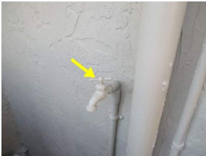
Hose faucet did not operate at the time of the inspection.