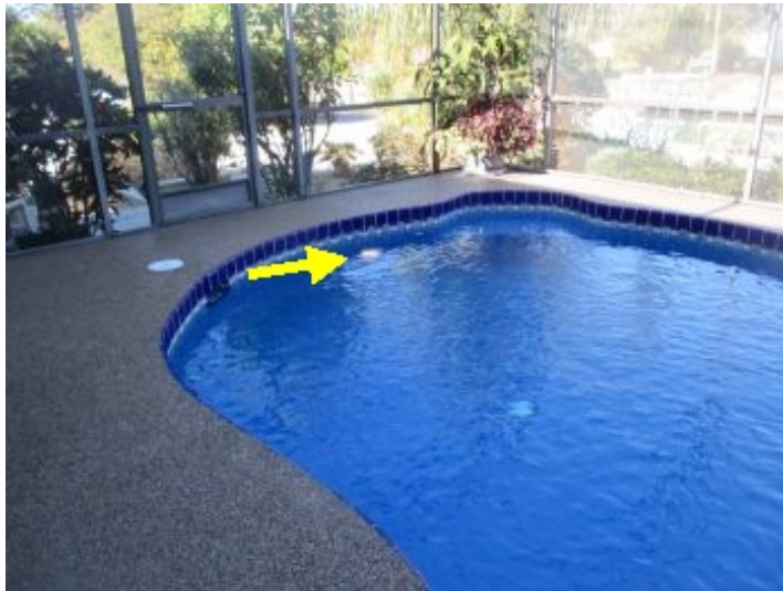
Pool light operated at the time of the inspection.