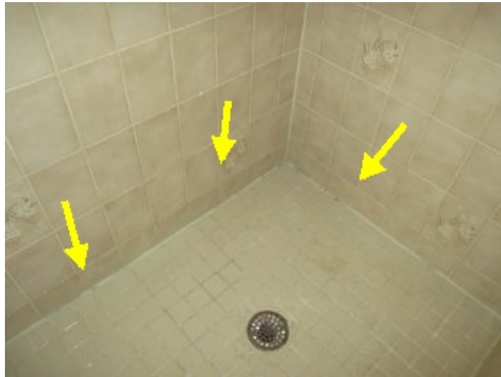
Caulk and / grout tiles as needed.