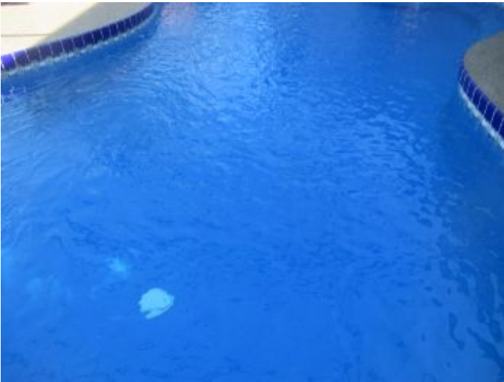
Cosmetic pool finish appeared to be in good condition.