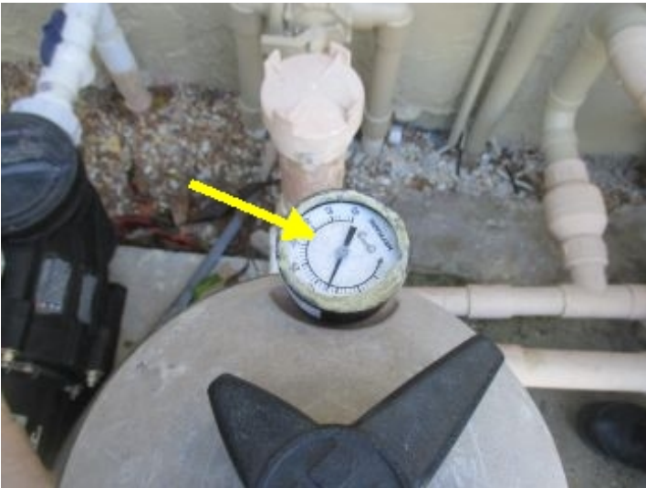
Filter pressure gauge did not appear to operate.