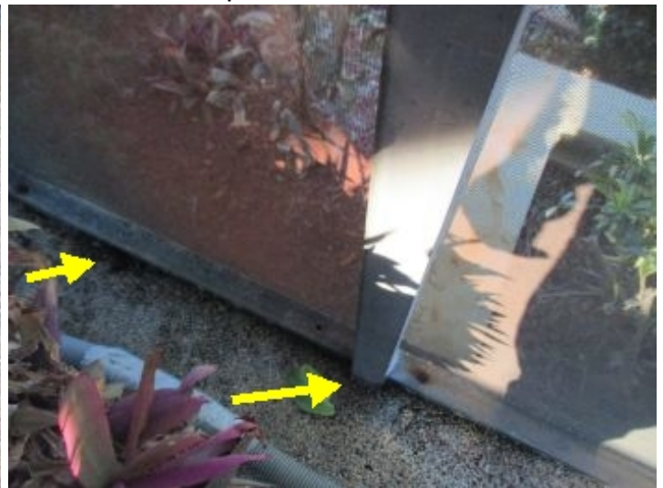
Fasteners of the screen frame to the concrete were deteriorated and should be resecured / replaced as needed.