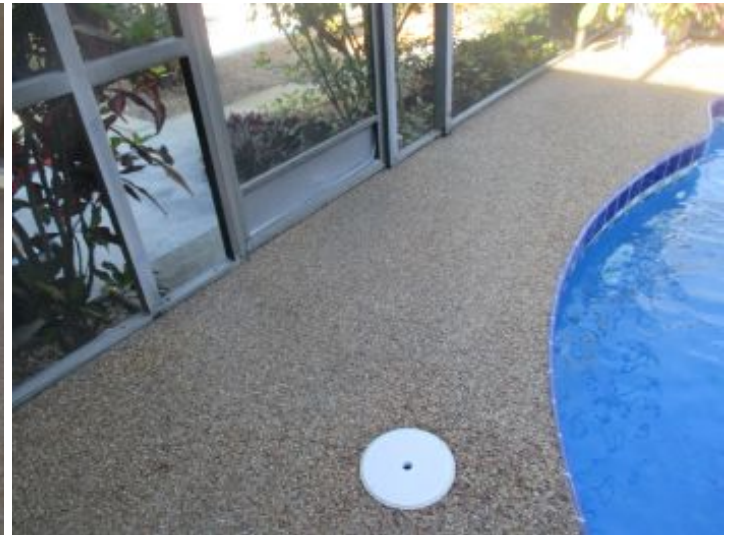
General overall condition appear satisfactory at the time of inspection.