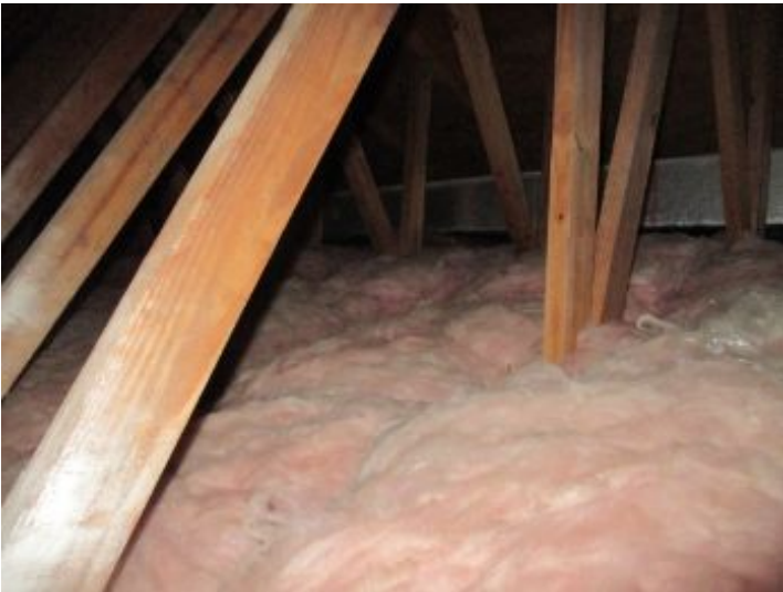
General overall condition appear satisfactory at the time of inspection.