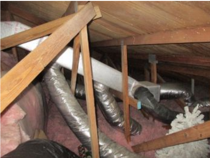
Visible areas appeared functional and in satisfactory condition at the time of inspection.