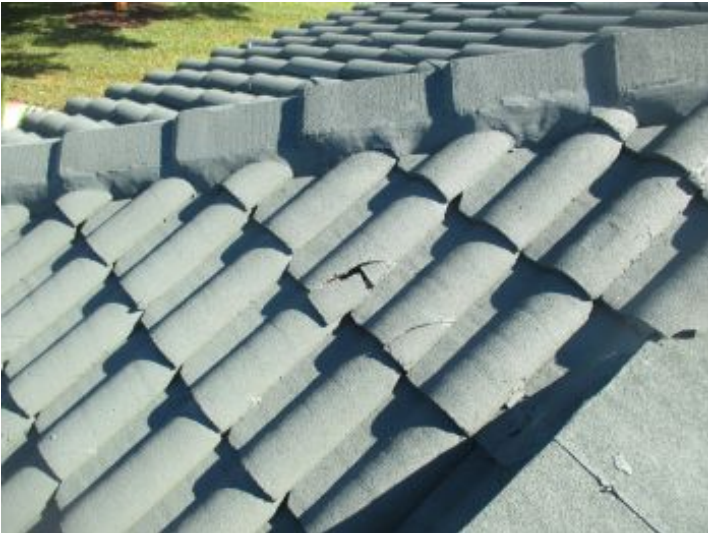
Many cracked and broken tiles on the roof. Recommend evaluation by a licensed roofing contractor.