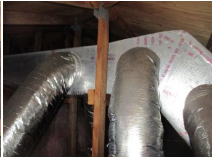
Visible areas appeared functional and in satisfactory condition at the time of inspection.