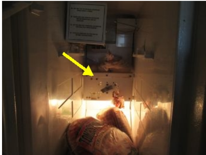
Ice maker did not operate / leaked.