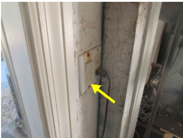
Switch did not operate properly / worn.