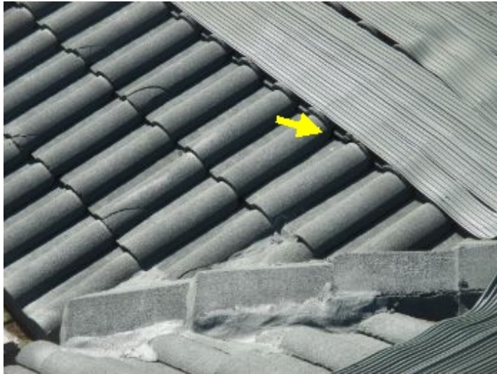
Solar piping on roof was leaking.