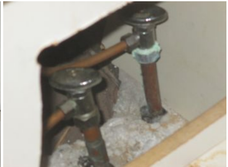
Tub faucet did not operate properly. Water is turned off at shutoffs located in the vanity access panel.