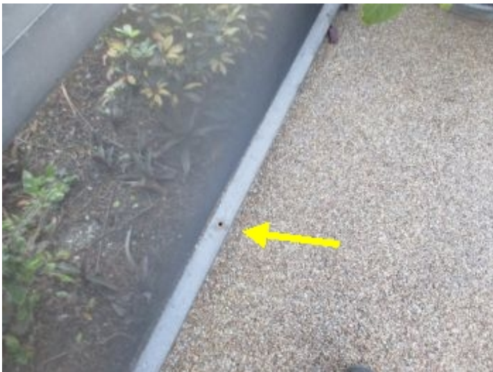
Fasteners of the screen frame to the concrete were deteriorated and should be resecured / replaced as needed.